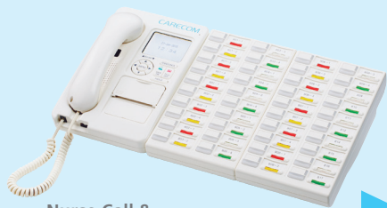
Nurse Call & Care Management System BCAC